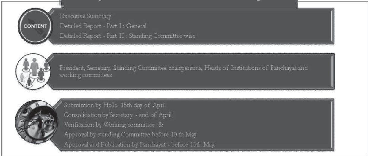
Figure 2 : Annual Administration Report

The mandatory chapters in the AAR of the Grama Panchayat are given below.